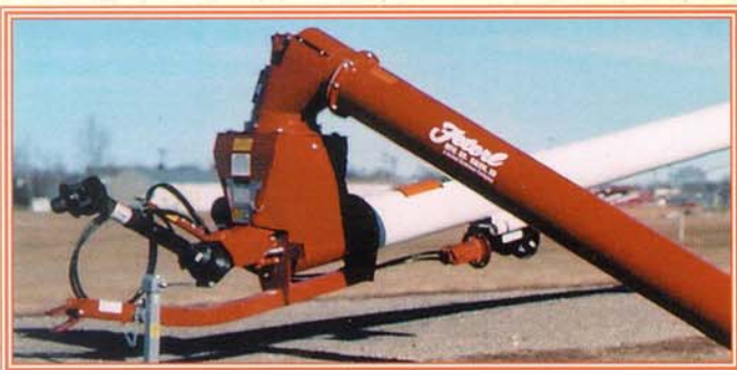
Hopper is attached to auger inlet.

8" Hopper: 42"x32"x10-1/2" Deep 10" Hopper: 60"x32"x10-1/2" Deep