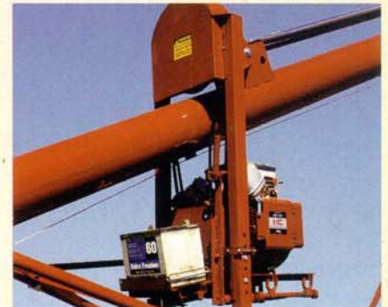
GASOLINE ENGINE DRIVE Optional Battery Holder.